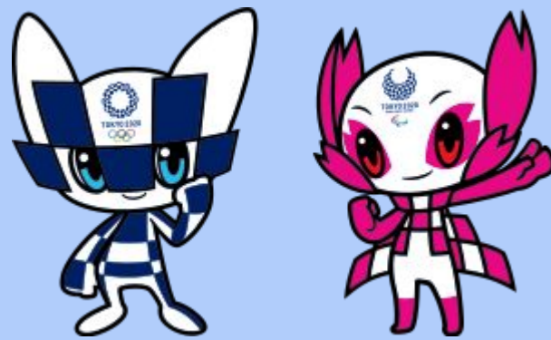
Miraitowa and Someity - Tokio 2020